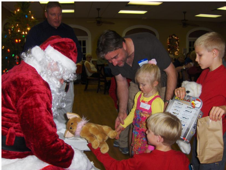
SANTA SHARING THE CHRISTMAS SPIRIT DURING HIS VISIT TO GULF COAST VIKINGS LODGE 3-683.