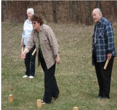
Kubb competition heats up

Valg i Valhalla weekend - Zone 2 weekend at LOV