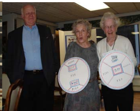
Ull Party Singers