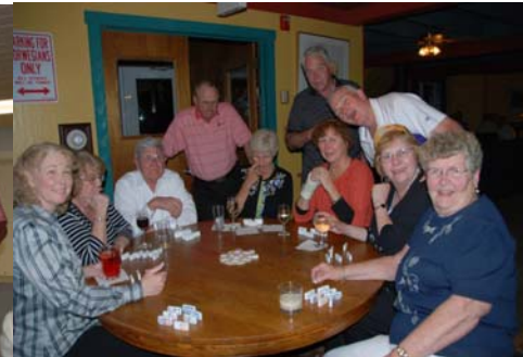
The Domino Players