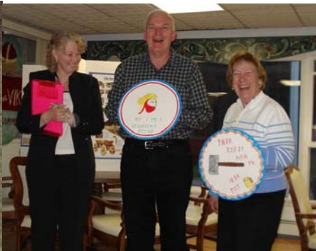
Thor's Thunderbolt Party