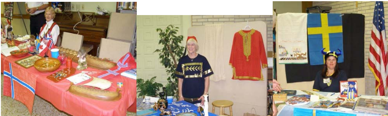
Third District Today