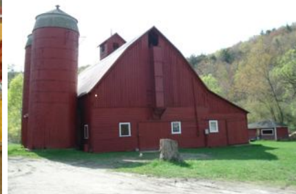
Our Historic Barn