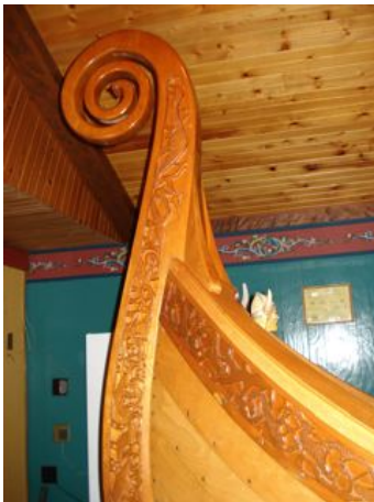
The Viking Bar

Because our District covers such a large geographical area, many of you are unable to visit LOV. Since this is the 30 th anniversary of LOV, we would like to share some pictures with you in this and future editions of TDT. If you are ever in the area and your plans permit, stop in for a visit!