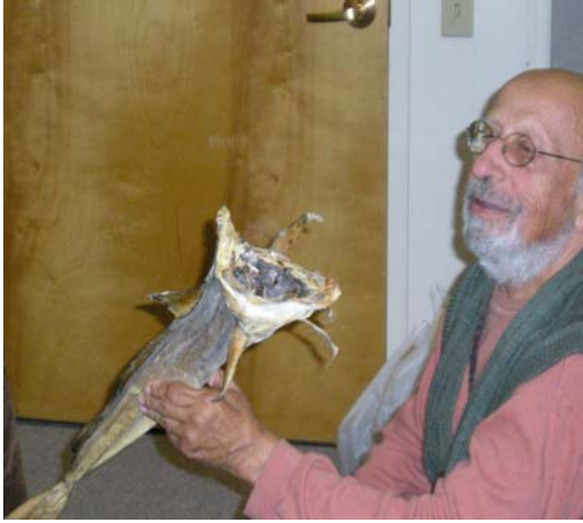
Hmm..... I have to be polite