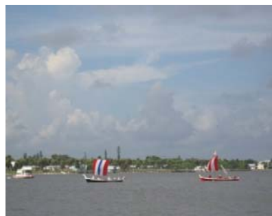
Suncoast & Gulf Stream