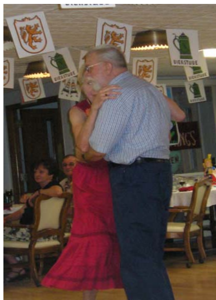
Dancing the night away!