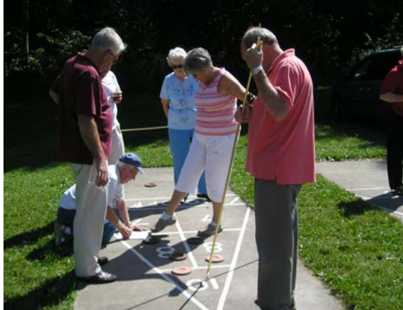
some serious shuffle board