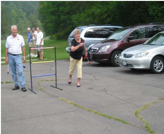
you don't want to know the name of this game